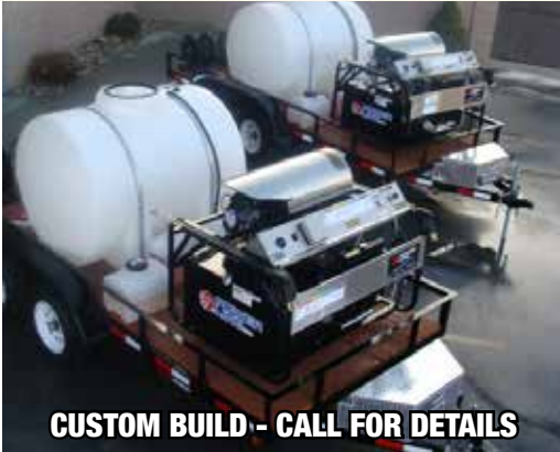
CUSTOM BUILD - CALL FOR DETAILS

Diesel Engine • Diesel Heated HOT/COLD/STEAM PRESSURE WASHER Diesel Series